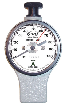
PTC® Ergo Style Durometer