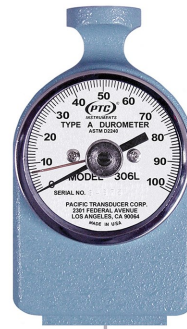
PTC® Classic Style Durometer

These stands will test materials up to 5" thick. Custom stands are available for larger samples.