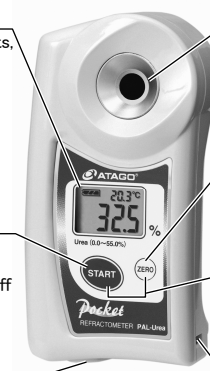
Image is for explanation purposes only. It may be different than the actual product purchased.