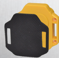
Skidproof cushion (In front of the safety helmet)