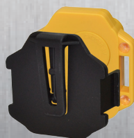
Bracket (At the pocket of the shirt)