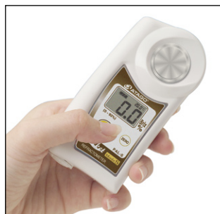
Press the START key.