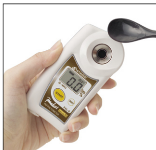
Place a sample on the prism.