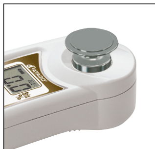
Put the provided MAGIC™ on top.